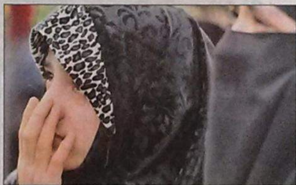
A girl mourns during the funeral of Fardeen Ahmad Khanday in Tral

The Spl DG said the identity of the third terrorist, whose