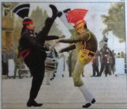
STEP BY STEP?

Pakistan wants with India an across-the-board engagement that is but a euphe-