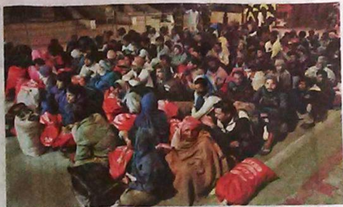
Back home: Indian fishermen released by Pakistan wait for buses after crossing the border at Wagah last week.

A differently abled minor, Hasnain, was repatriated to