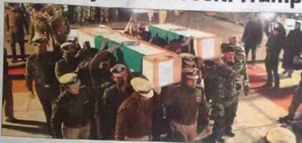
CRPF personnel carry the coffins of colleagues killed Sunday in the Pulwama terror attack in the Valley.