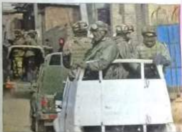
पुलवामा में सीआरपीएफ कैम्प पर हमले के बाद सेमवार को तलाशी अभियान में जुटे सुरक्षाबल के जवान।

दक्षिण कश्मीर में सुरक्षा कार्रवाई में रेल सेवारत निलंबित - दक्षिण कश्मीर के पुलवामा में रविवार को सुरक्षाबलों और आतंकवादी संगठन जैश-ए-मोहम्मद के बीच मुठभेड़ में दो स्थानीय आतंकियों के मारे जाने के बाद सेमवार को रेल बर्ष के पहले दिन घाटी में सुरक्षा कारणों से रेल सेवारत निलंबित कर दी गई है।