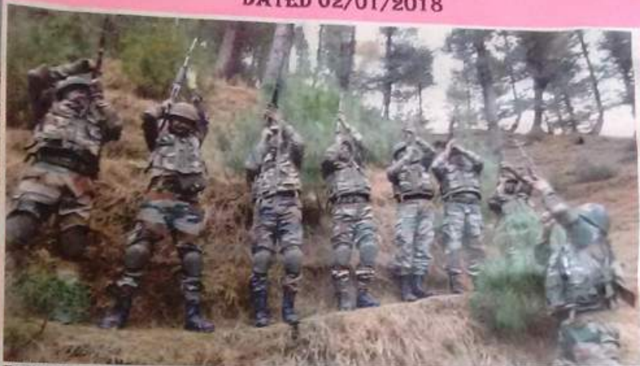
The Ghatak troops of a Rajput regiment unit were involved in the cross-border raid in the last week of 2017 where they crossed over and killed four Pakistani troops avenging the death of their colleagues.