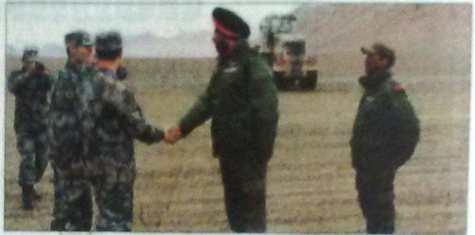
Vijay Gokhale was instrumental in ending Doklam standoff— File photo

The Appointments Committee of the Cabinet has approved Gokhale's appointment to the post, said the or-