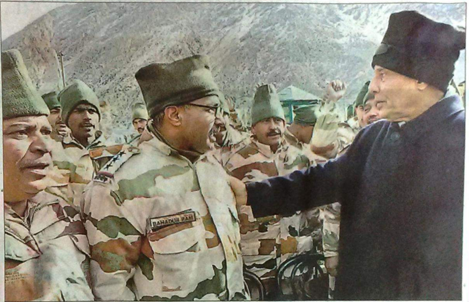
उत्तरकाशी में सोमवार को चीन सीमा पर स्थित चौकी पर आईटीबीपी जवानों का हौसला बढ़ाते गृह मंत्री राजनाथ सिंह।