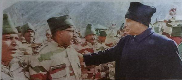
उत्तरकाशी के नेलांग में सीमावर्ती आइटीबीपी के जवानों से मिलकर उत्साह बढ़ाते कैदीय गृह मंत्री राजनाथ सिंह • पेट

जागरण संवाददाता उत्तरकाशी बर्फलेले जवाओं के बीच भारत-चीन सीमा पर स्थित नेलांग चौकी पर तैनात सिपायियों के होमले को देख गृह मंत्री राजनाथ सिंह ने कहा 'आपके जन्मे से ही सीमाएं सुरक्षित हैं। हमें आप पर गर्व है।' नववर्ष मनाने पहुंचे राजनाथ भारत-तिब्बत सीमा पुलिस (आइटीबीपी) के जवानों को सौदात देना भी नहीं भूले। उन्होंने कहा कि अब 11 हजार अथवा इससे अधिक ऊंचाई (हाई एल्टीट्यूड) पर तैनात जवानों को यहां तीन माह की अवधि नहीं गुजारनी होगी। इस अवधि को कम किया जा रहा है। हालांकि, यह कितनी होगी, अभी नहीं कहा जा सकता।