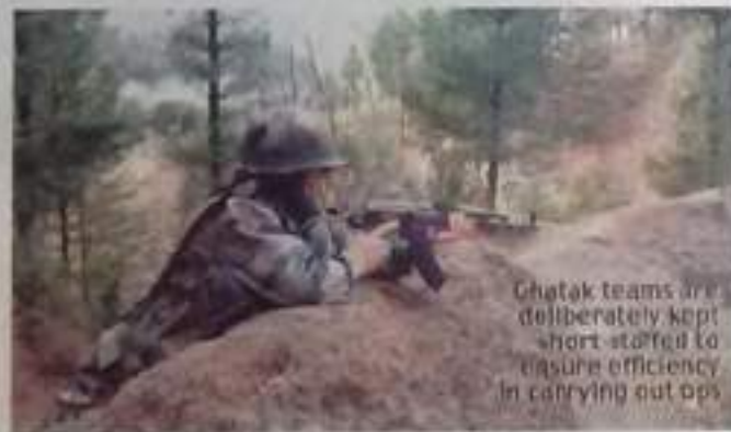
Ghatak teams are deliberately kept short-staffed to ensure efficiency in carrying out ops